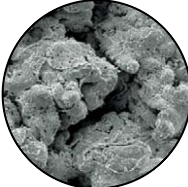
Photo 2B: Pulse Technology removes lead sulfate crystals and returns them to the battery acid as active electrolyte. This process also exposes the active material of the battery plates which means batteries are stronger so they work harder and last longer.